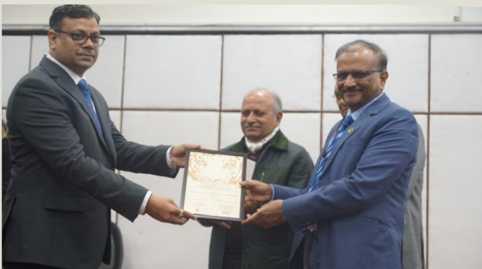
Western Circle, Haldwani, Uttarakhand