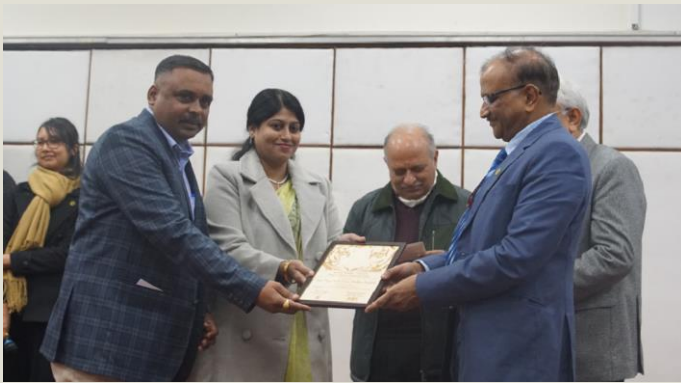
State Tiger Strike Force, Madhya Pradesh