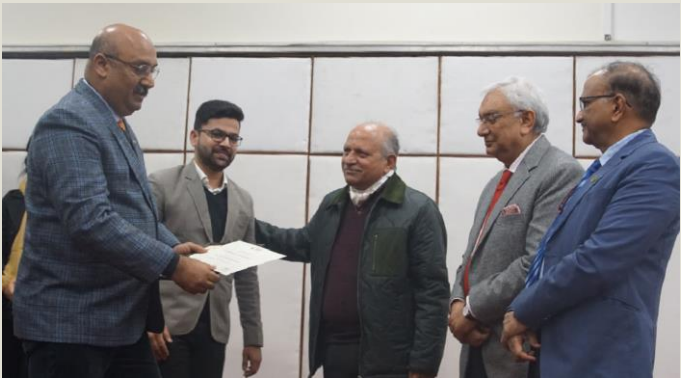
M.P. Tiger Foundation Society